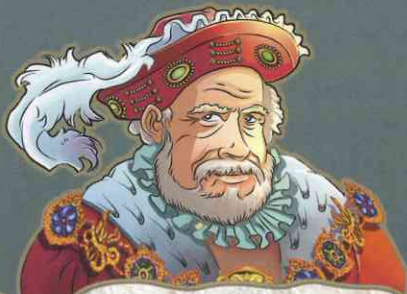
King Henry VIII

... is a common boy who looks very much like Prince Edward. He lives in one of the poorest parts of London, where his father makes him beg in the streets. He is a good boy who dreams about living like a prince.