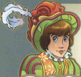
Edward Tudor, Prince of Wales

... is the son of King Henry VIII. He lives a rich life inside the royal palace, but has no freedom. He is a kind and fair boy, but wishes he could be free and play in the streets like a simple child.